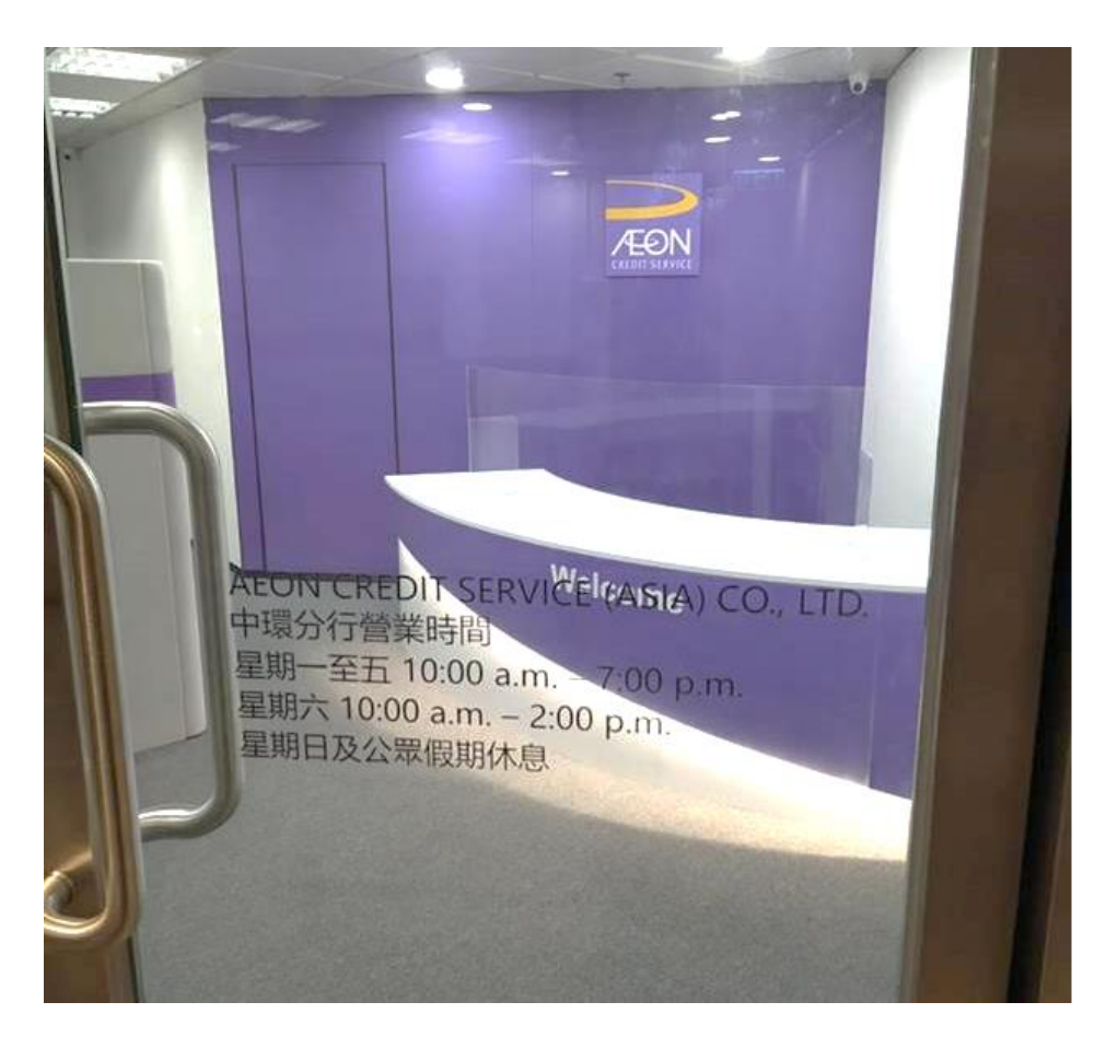
Central Branch at Century Square