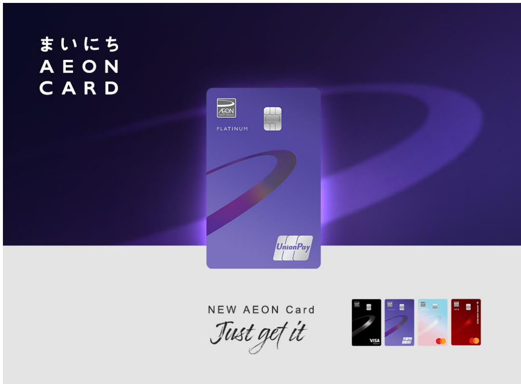
AEON Credit Service launches modern and eco-friendly new vertical credit card to intensify premium payment experience