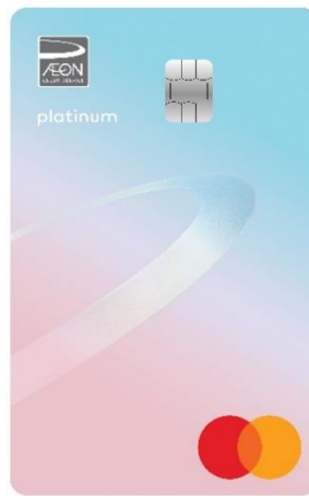
AEON CARD WAKUWAKU