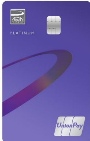
AEON Card Purple