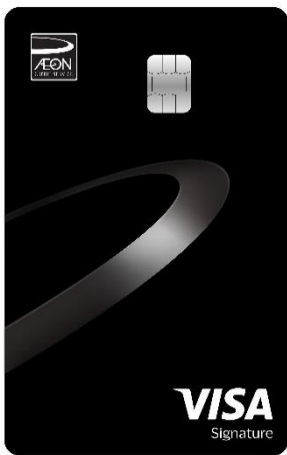
AEON Card Premium