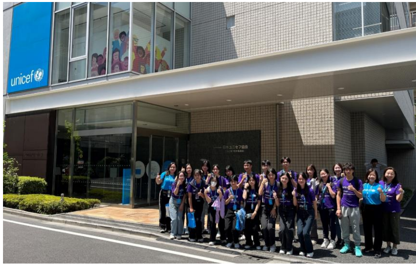
Young Envoys visited Japan Committee for UNICEF and learned about the implementation of Children Friendly Cities Initiatives in Japan.