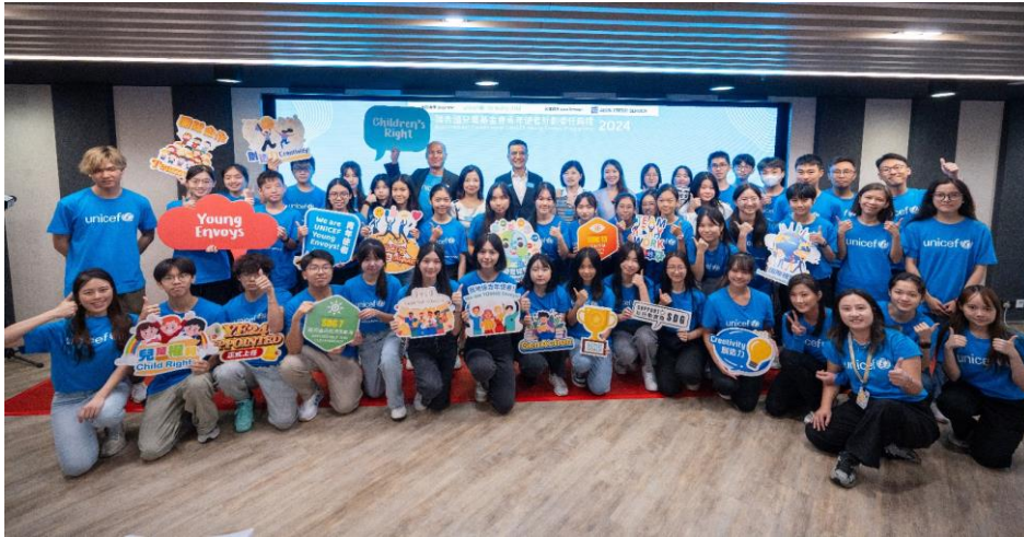
The “UNICEF Young Envoys Programme 2024” was successfully completed with 37 Young Envoys received their appointments.